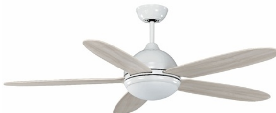
ROYAL DAISY WHITE 52"/AC/DR/SL