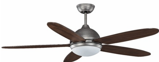
ROYAL DAISY COPPER 52"/AC/DR/SL