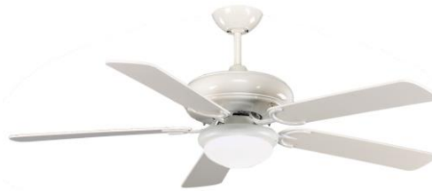
Model : Bali-WH

Motor 10 Years Warranty มอเตอร์รับประกัน 10 ปี