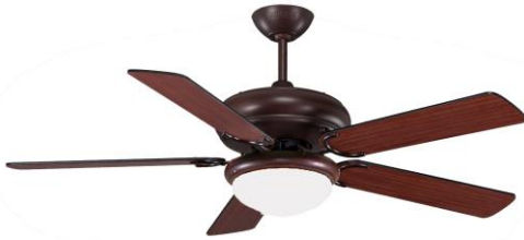
Model : Bali-MB