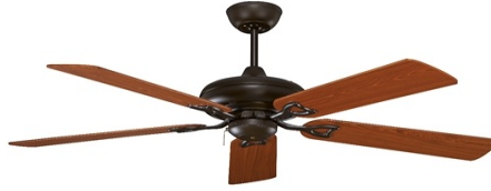
ROYAL CLASSIC CAFE 52"/AC/DR/NL