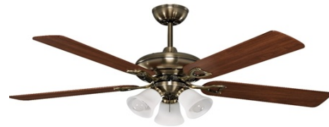
ROYAL CLASSIC COPPER 52"/AC/DR/SL