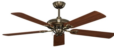
ROYAL CLASSIC COPPER 52"/AC/DR/NL

No Motor Wobble អង្គភាពធានារ៉ាប់រង មិនរំញ័រ