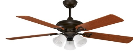
ROYAL CLASSIC CAFE 52"/AC/DR/SL